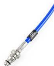
HEL flexible braided clutch line for Toyota GT86 and Subaru BRZ Right Hand Drive (2012-2021) Part No. CCK039