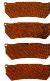
Carbon fibre brake pad shim Part No. HCFS-4-043