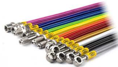
HEL braided brake lines Part No. TOY-4-116